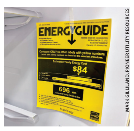
When shopping for appliances, look for the Energy Star logo on the energy guide to identify which products are the most efficient options.

If an energy efficiency upgrade requires improving the electrical panel in your home, there's also a tax credit for that. You can receive 30% of the cost of