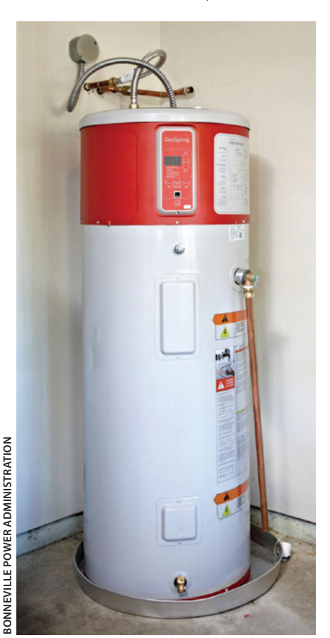
Tax credits for Energy Star-rated heat pump water heaters cover 30% of the project cost, or up to $2,000.

First, knowing the difference between a tax credit and rebate is important. A rebate is a payment for purchasing or installing a qualified product or home improvement. Depending on how the rebate program is set up, it may be provided at the time of purchase or applied for and received after installation. In some cases, the rebate is