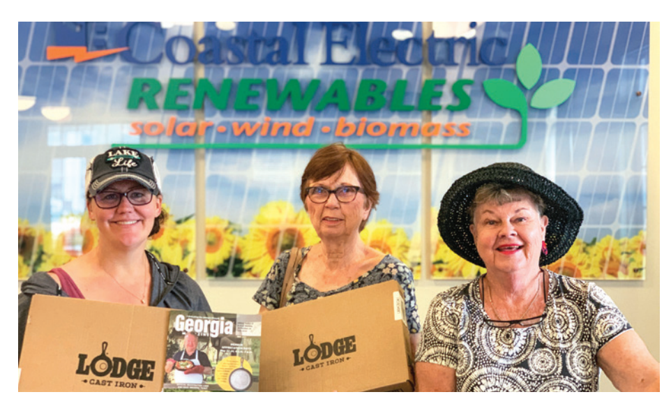
Almost 2,500 members registered during this year's Member Appreciation Days—more than ever before. These three neighbors from Liberty County stopped by the Richmond Hill office as they were out on a girls day out.

You can find the 2023 Annual Meeting video on Coastal Electric's YouTube channel, Facebook page or online at www.CoastalElectric. Coop/live .