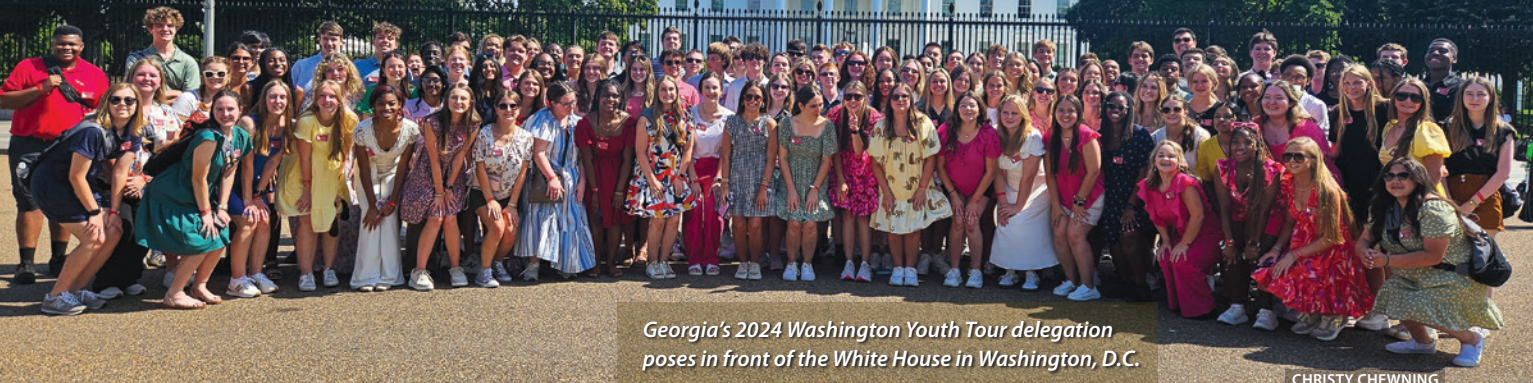
Georgia's 2024 Washington Youth Tour delegation poses in front of the White House in Washington, D.C.