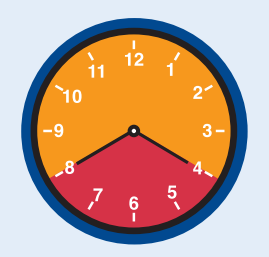
4-8 p.m., including all weekends and holidays