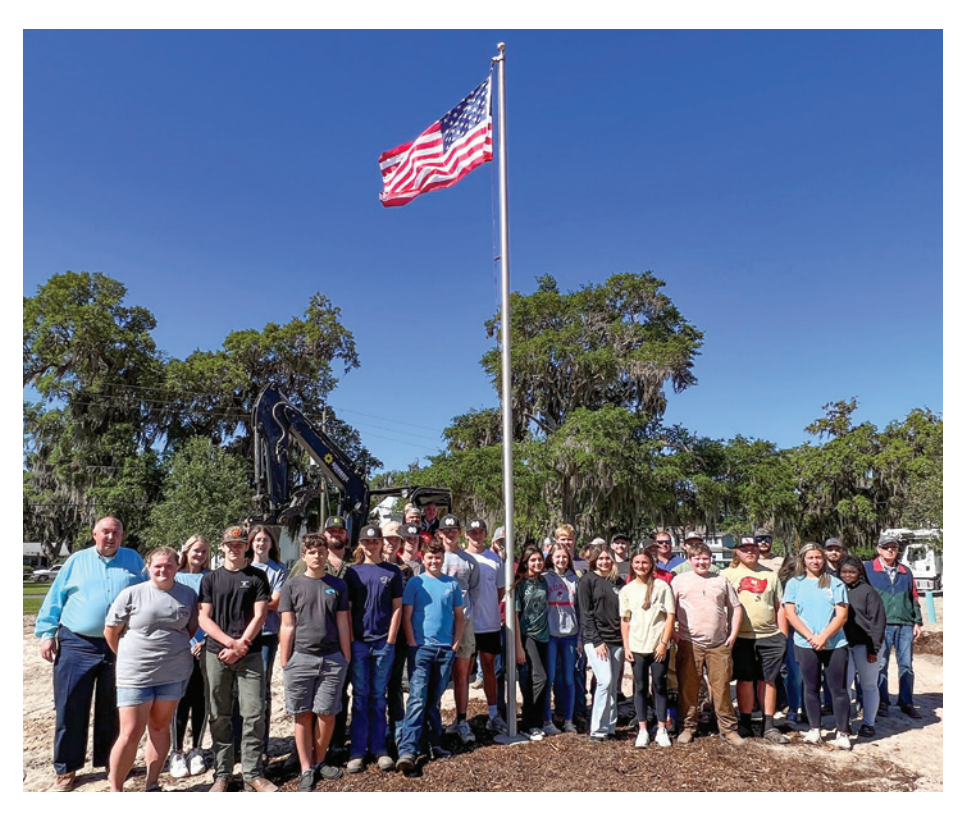
Coastal Electric staff and student volunteers stand proudly near the flagpole raised on historic Oglethorpe Square.